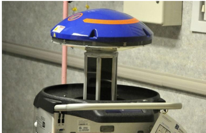
Figure 1. Pulsed Xenon Ultraviolet Germicidal Irradiation Lamp at William Beaumont Army Medical Center