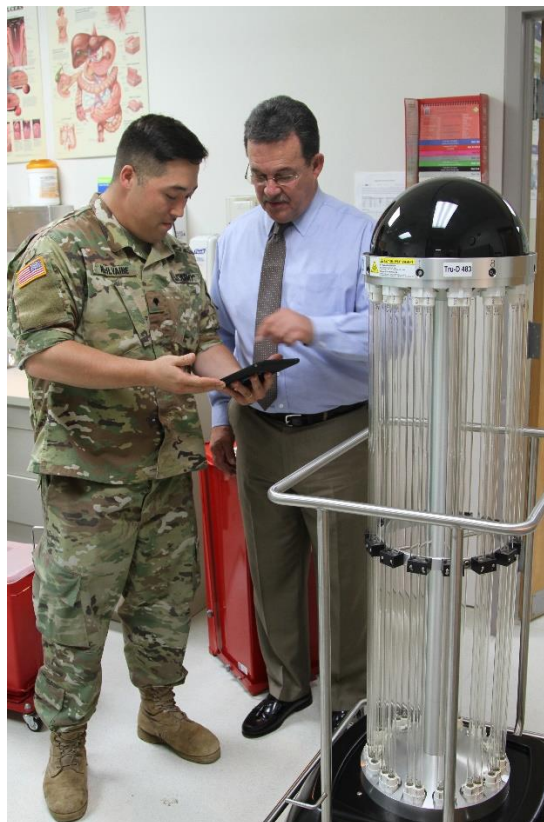
Figure 2. Low Pressure Mercury Ultraviolet Germicidal Irradiation Lamp at Brian Allgood Army Community Hospital