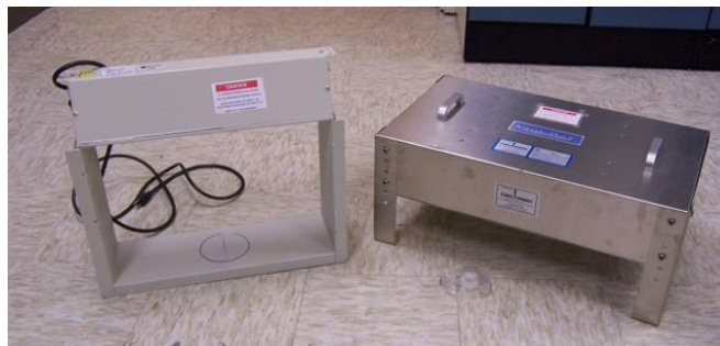
Figure 4. Tabletop Ultraviolet Germicidal Irradiation Lamps

Note: Photograph by U.S. Army Public Health Center (APHC); Nonionizing Radiation Division (NRD)